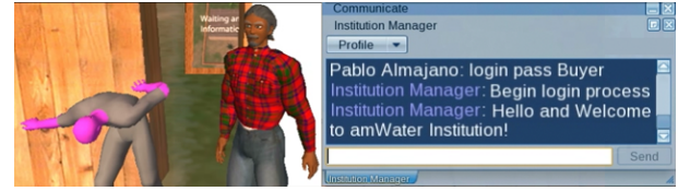
Figure 3: Human avatar login: interaction with a software agent by means of a chat window