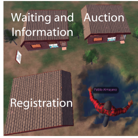
Figure 2: Initial aerial view of v-mWater

market facilitator conducts the auction and the basin authority announces the resulting valid agreements.