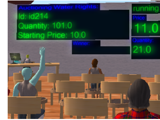
Figure 4: Bot bidding in a running auction

artificial skin colours that represent their roles (see Figures 3 and 4). Fig. 3 shows the login to the institution: the human participant sends a private message to the Institution Manager bot with the password and role (either seller or buyer). Fig. 4 illustrates how human participation in the auction has been improved by providing a comprehensive 3D environment. There, the market facilitator bot appears sited at a desktop and buyer participants at the chairs in front of it. This room includes dynamic information panels. Moreover, bots' bid actions can be also easily identified by human participants since they are displayed as raising hands.