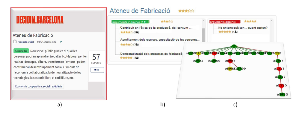
Figure 2. Proposal 50 as in a) Decidim (just general description shown), b) PAM, c) TODF.