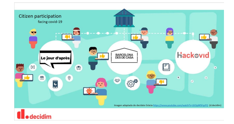
Figure 1. Different initiatives to face COVID-19 pandemic enabled by the Decidim platform.

from some social actors such as the initiative of Spaceship Media [10], which emerged in the United States in the context of the political fracture produced in the Trump era. They argue that dialogue from difference is essential for the proper functioning of democracy.