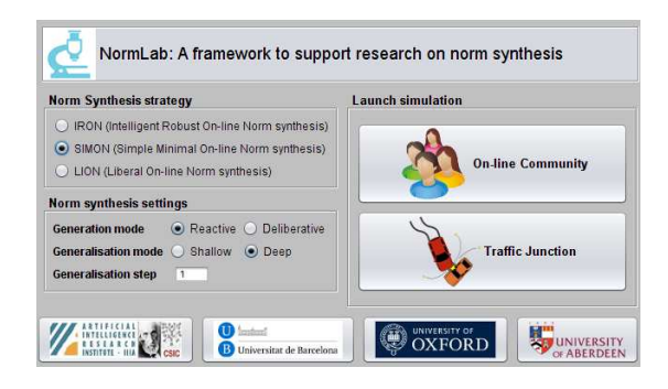
Figure 1: NORMLAB's initial menu.

Appears in: Proceedings of the 14th International Conference on Autonomous Agents and Multiagent Systems (AAMAS 2015), Bordini, Elkind, Weiss, Yolum (eds.), May 4–8, 2015, Istanbul, Turkey. Copyright © 2015, International Foundation for Autonomous Agents and Multiagent Systems (www.ifaamas.org). All rights reserved.