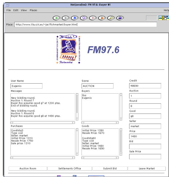
Fig. 3: Human Buyer Applet