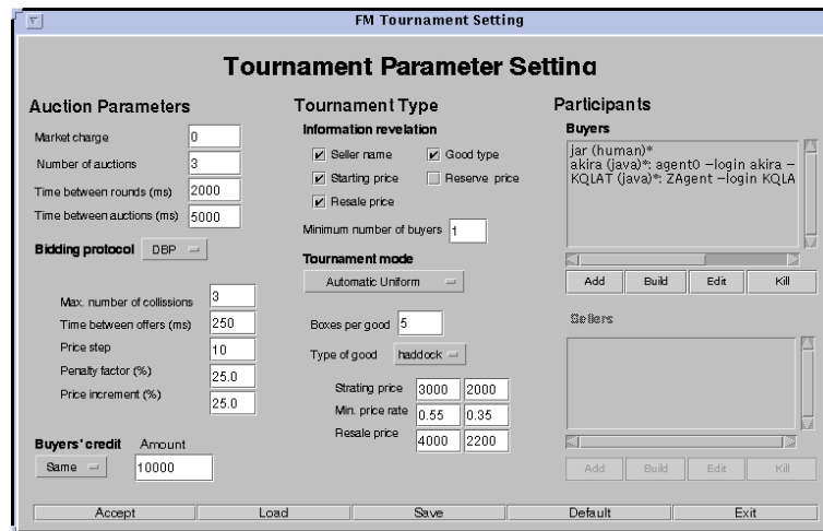
Fig. 1: Tournament Parameter Settings

Java-based version of the Fishmarket auction house), FM allows to define trading scenarios based on fish market auctions (Dutch auctions). It provides the framework wherein agent designers can perform controlled experimentation in such a way that a multitude of experimental market scenarios—that we regard as tournament scenarios due to the competitive nature of the domain—of varying degrees of realism and complexity can be specified, activated, and recorded; and trading (buyer and seller) heterogeneous (human and software) agents compared, tuned and evaluated. We argue that such competitive situations constitute convenient problem domains in which to study issues related with agent architectures in general and auction strategies in particular.